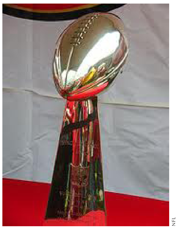
Many trophies made of silver, like the Vince Lombardi Trophy seen here, are awarded for sports achievement.