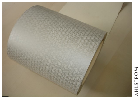
This wallpaper imbedded with silver prevents hackers from eavesdropping on Wi-Fi signals.

Previous stealth wallpapers have been produced using copper instead of silver, but the costs were about $25 a square foot. The new wallpaper will cost about the same as a "classic, mid-range" wallpaper, according to the developers. For an executive summary of the report, <u>click here</u>.