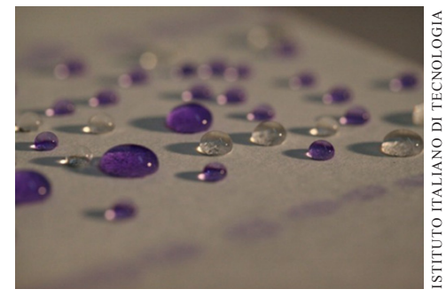
A new technique can make paper waterproof, magnetic, antibacterial and even fluorescent – all at the same time.

An important benefit, the team notes, is that because the paper as a whole is not being coated, it retains all of its usual properties, allowing it to be written upon by pens and pencils or printed upon by machines. In addition, the process can be applied to existing paper, giving new properties to magazines, books or other documents.