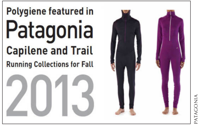
The odor-resistant silver used in this fall's Capilene line is from recycled sources.

Swiss-based bluesign technologies, founded in 2000, is a standard for textile processes designed for maximum resource productivity along with environmental protection, health and safety.