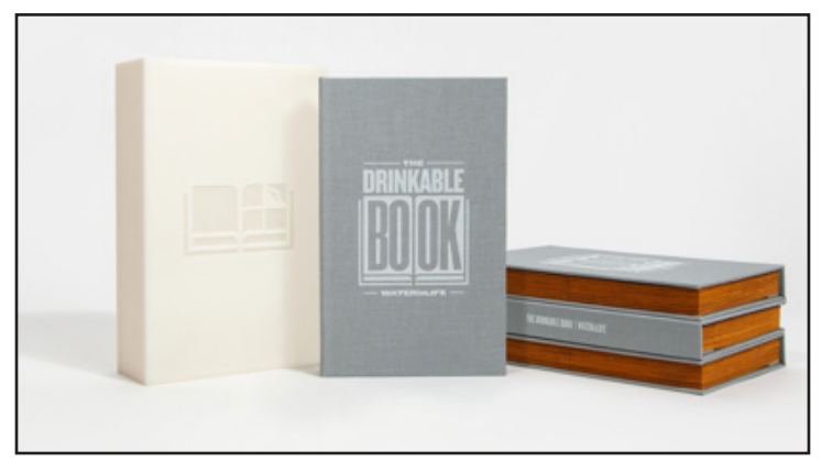
Click on the image to see the Drinkable Book in action.

"A lot of water issues aren't just because people don't have the right technology, but also because they aren't informed why they need to treat water to begin with."