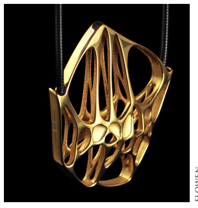
The Hexa Pendant is 'grown' from sterling silver powder.

Most of the pieces are silver but then plated with either gold or covered with a rubber coating. The Flowen Specimens, as they're referred to by the artists, are recognizable through their trademark use of the Greek letter phi, which represents the golden ratio in mathematics and is intrinsically linked to the form and behaviors of the natural world, the artists note.